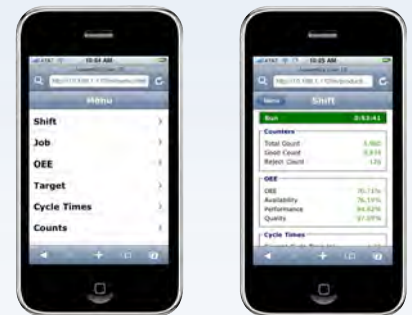
Access your data anywhere, including right on your iPhone™!