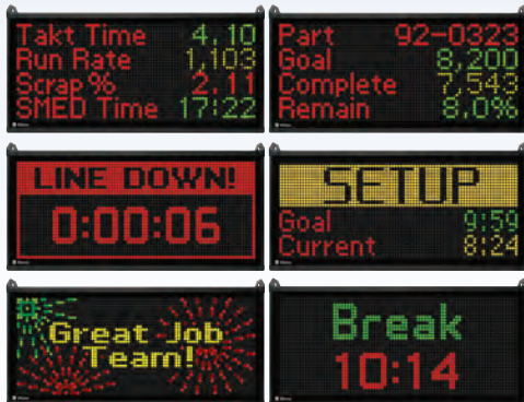
Flip screens automatically based on what's happening on the plant floor.

Every production situation is unique. That's why XL makes it especially easy to select the metrics that are most meaningful for your plant floor. With 100+ metrics available "out of the box", XL easily adapts to your needs. Plant floor events are immediately reflected on the XL Visual Display, providing a direct link between action (line goes down) and reaction (operator resolves problem).